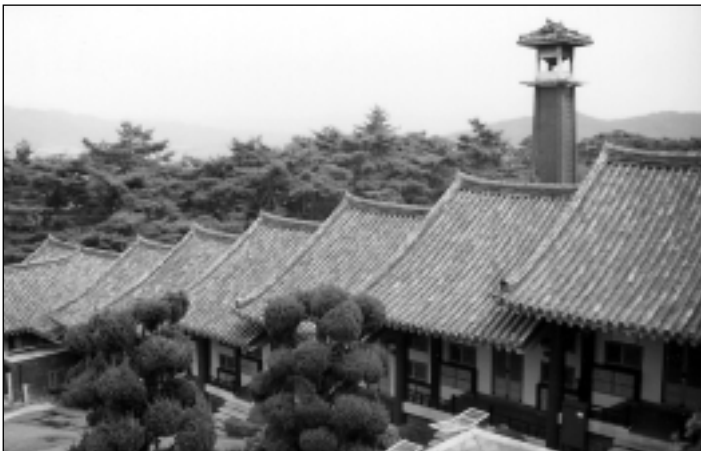
The mission of the Hwarang Educational Institute, built in 1973, is to develop the spirit of the Hwarang in today's Korean students.

Founded under King Jin Heung, Hwarang-do or “the way of the flowering manhood,” represented a fraternity of Silla's noble elite composed of young people drawn from prestigious families. In addition to being trained in kwonbop and subahk , yet another native fighting style, the Hwarang were governed by the Five Codes of Human Conduct. These Five Codes served as a set of moral standards handed down by the Buddhist monk, Wonkwang Popsa, after he was approached by Kwisun and Chuhang, two Hwarang warriors seeking ethical guidance. Among these tenets were those emphasizing loyalty to one's country, the demonstration of respect towards elders, and restraint against the wanton spilling of blood in battle. In an effort to satisfy their spiritual as well as their martial needs, the young warriors of the Hwarang