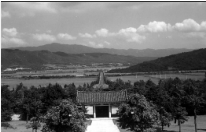
Tong-II Jeon Palace is situated on the training fields of the Hwarang in what was once the ancient kingdom of Silla.